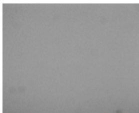
Flat field from SBIG Even-Illumination Shutter