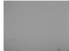
Twilight Flat from SBIG Even-Illumination Shutter